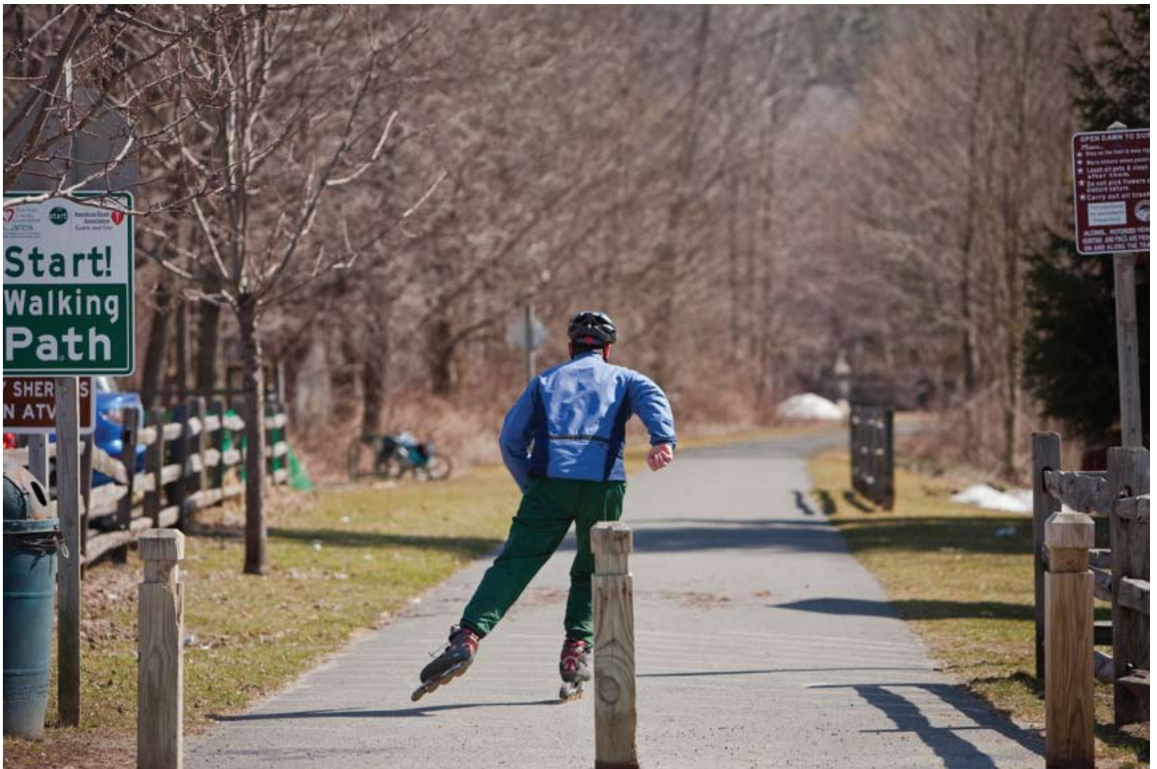
THE HARLEM VALLEY RAIL TRAIL CONNECTS AMENIA AND MILLERTON VIA EIGHT MILES OF PAVED FORMER RAILBED.

spring, the pair will break ground for a garden in the back for a ready supply of lettuces, herbs, and tomatoes. What they can't grow, they source locally.