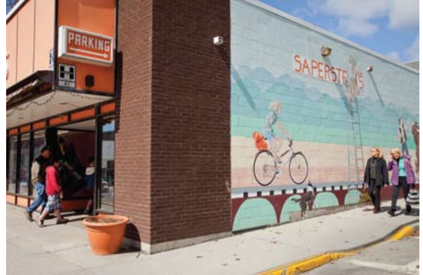
CLOCKWISE FROM TOP LEFT: HORSE LEAP TACK SHOP, AMENIA; OAKHURST DINER, MILLERTON; SAPERSTEIN'S DEPARTMENT STORE, MILLERTON; HARNEY & SON'S FINE TEAS, MILLERTON.

Even older is Terni's, which opened in 1919 as a place to shop for hunting gear and fishing tackle. At the marble ice cream counter, the 1930s mixer is still called into service to make milkshakes.