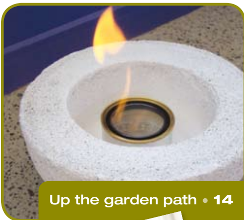
Up the garden path • 14