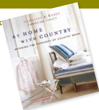
A book look • 4