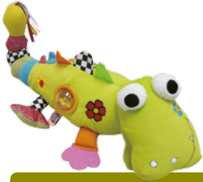
The baby boutique • 27