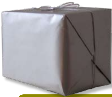
Make it a wrap • 24