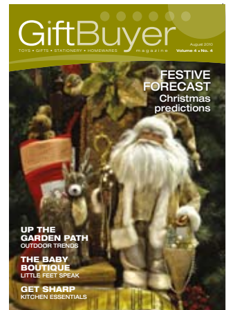
GiftBuyer No.4 August 2010