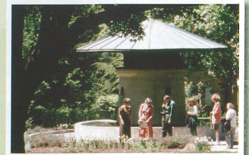
Sense Garden at Caramoor, Katonah

In each itinerary, photo opportunities and scenic lookout points, shopping stops and rest areas are noted.