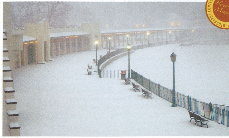
Playland Boardwalk in Winter

Something for everyone, any time of year.