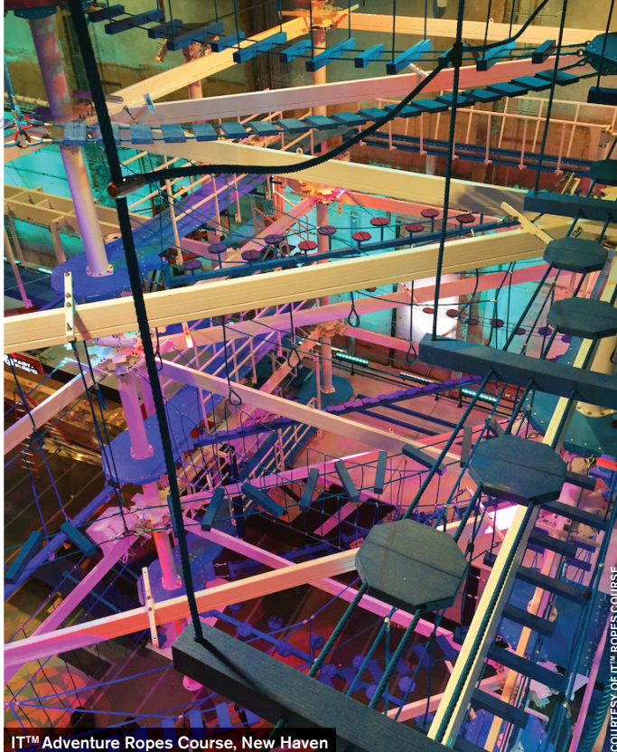
IT™ Adventure Ropes Course, New Haven