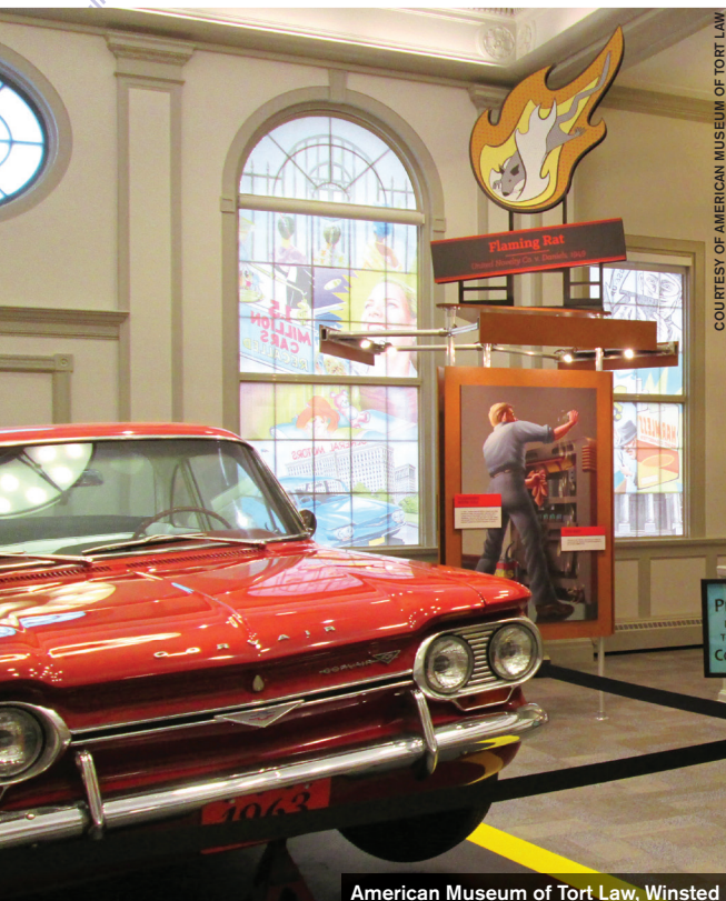
American Museum of Tort Law, Winsted

For a trip back to simpler times in the Litchfield Hills region, go antiquing. Find a cozy inn or B&B and make a weekend out of it. A statewide antiques trail of more than 100 shops, multi-dealer stores and auction houses ultimately leads visitors to Kent, Litchfield and Woodbury, which is the unofficial Antiques Capital of Connecticut . You'll bring a treasure home to remember your trip, maybe a vintage stone-ware mug to keep your coffee hot—no warning required.