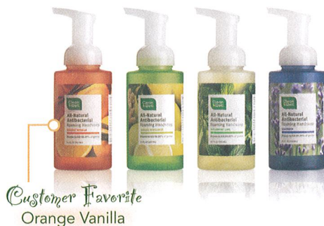
Customer Favorite Orange Vanilla